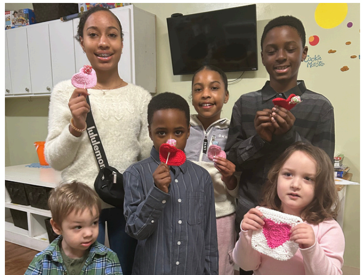
KIDS Central children are enjoying special Valentine treats!