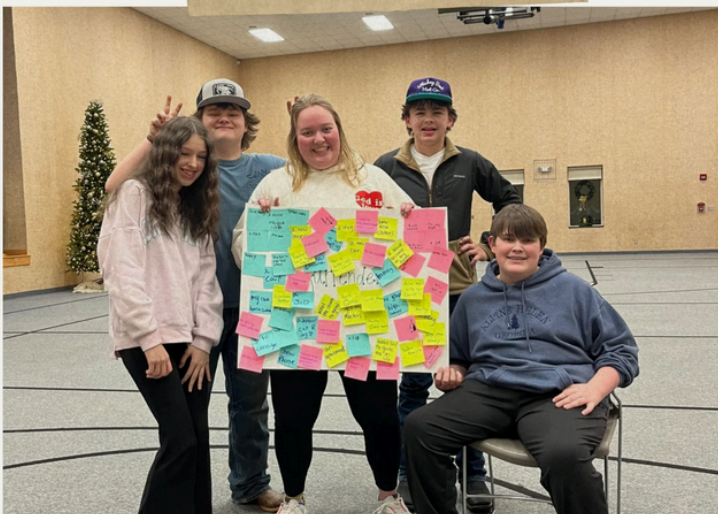
Central Youth with our plans for the New Year in January 2026!