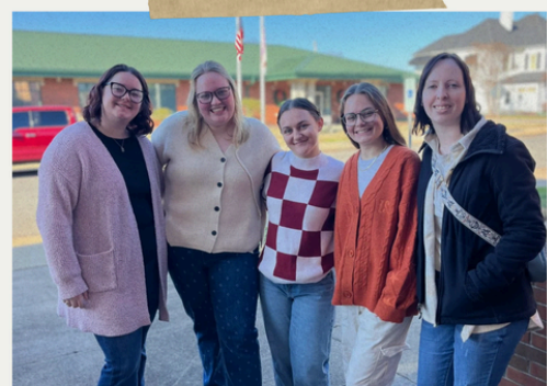
Our Young Adults gathered for fellowship in January 2026.

If you are interested in joining our Young Adult Small Group please get in touch with Kalin Brooks.