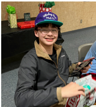
We welcome all youth from 6th-12th grade to come join us!