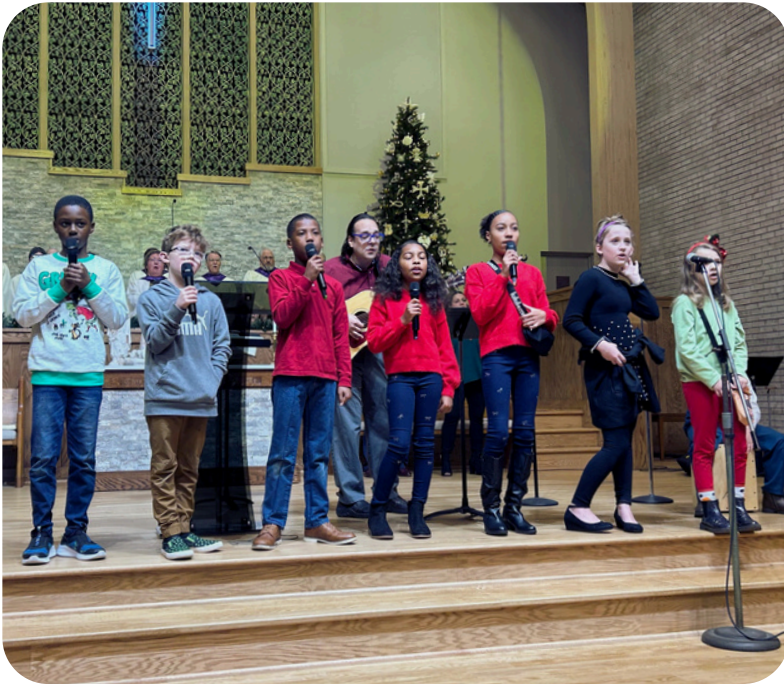
The Children's Choir performed during service during our Christmas Cantata on December 14, 2025