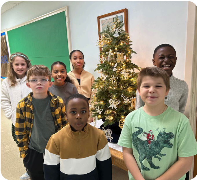
The children learned about Chrismons as they decorated their tree.

December was a busy month for Kids Central.