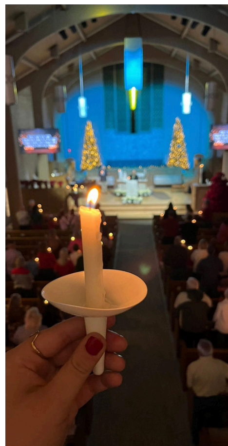
Scenes from our beautiful 2025 Christmas Eve Candlelight service.