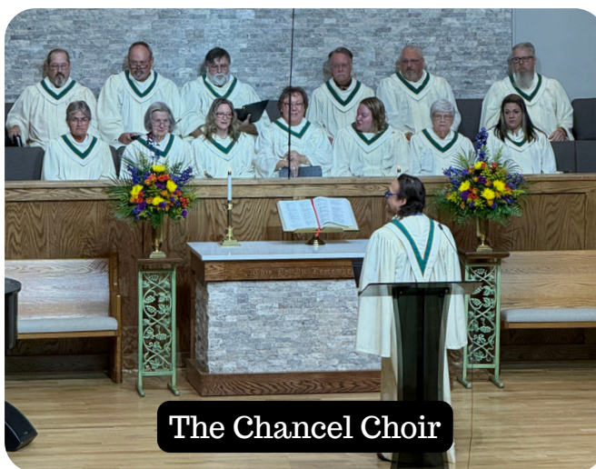
The Chancel Choir