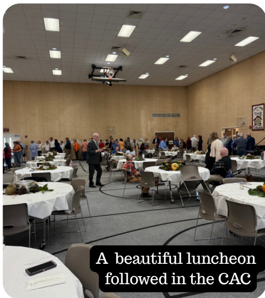
A beautiful luncheon followed in the CAC