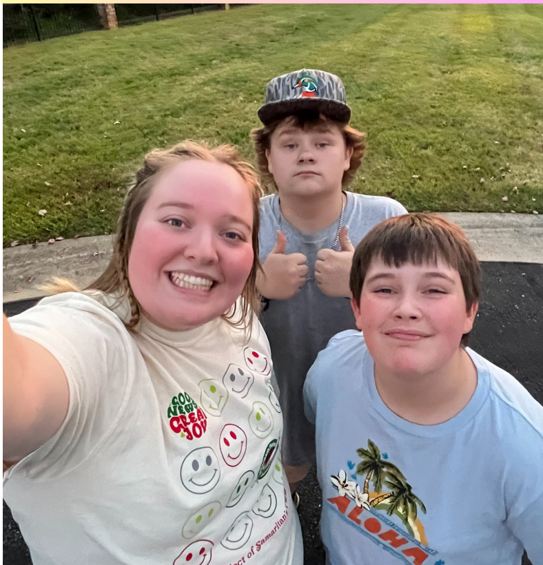
Central Youth at the See You at The Pole Event in September 2025

We welcome all youth from 6th-12th grade to come join us! We provide a time of gathering for youth to support one another, to have fun, to develop service projects, and to grow deeper in Christ.