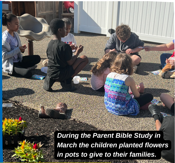
During the Parent Bible Study in March the children planted flowers in pots to give to their families.

Don't miss A Week that Changed Everything: Jesus's Impact on Sunday, April 13, 2025, from 3 PM to 5:30 PM. RSVP by 4/9/25.