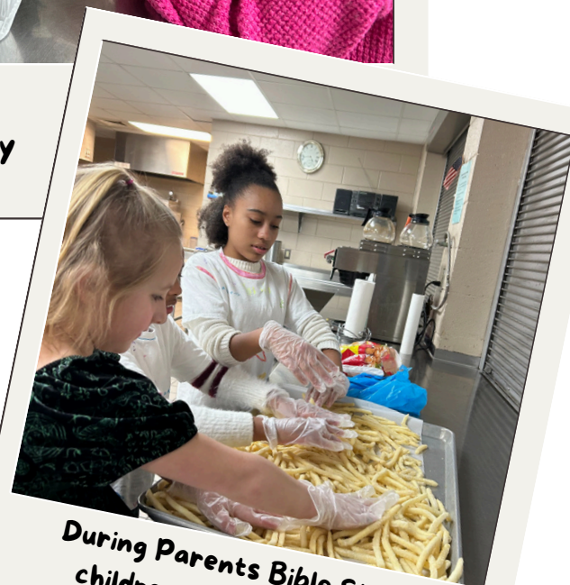
During Parents Bible Study the children prepare dinner for their Parents