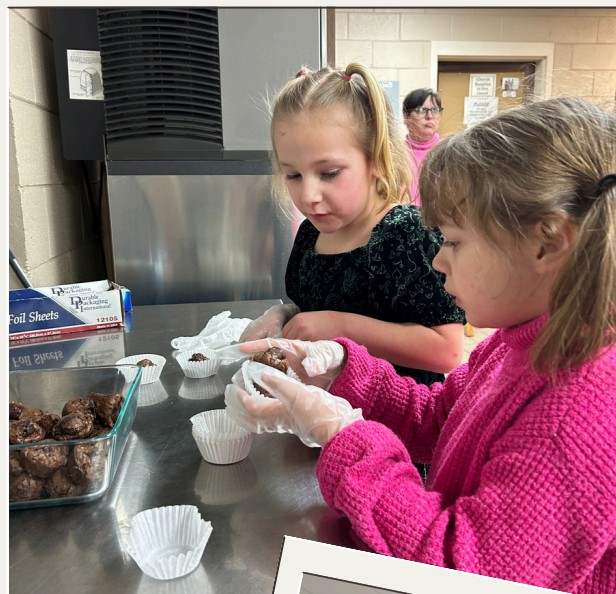
Parents Bible Study 2/23/25