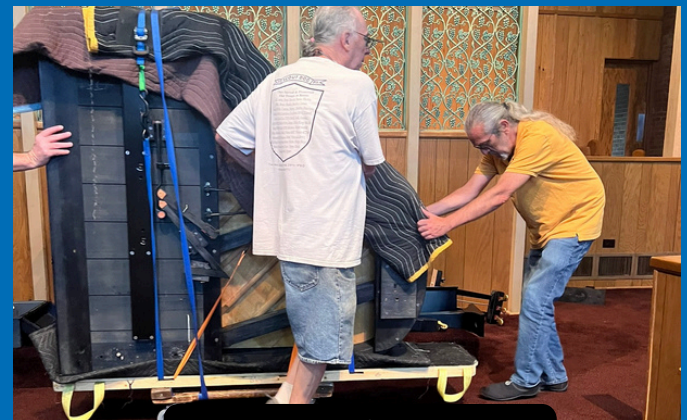
Removal of the piano