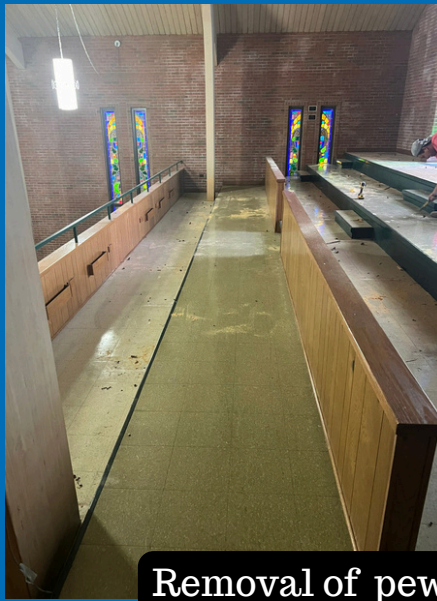
Removal of pews in the Balcony