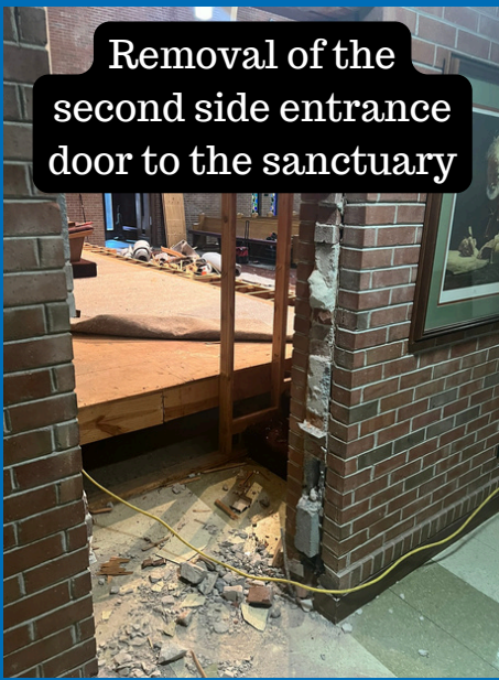
Removal of the second side entrance door to the sanctuary