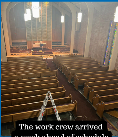
The work crew arrived a week ahead of schedule