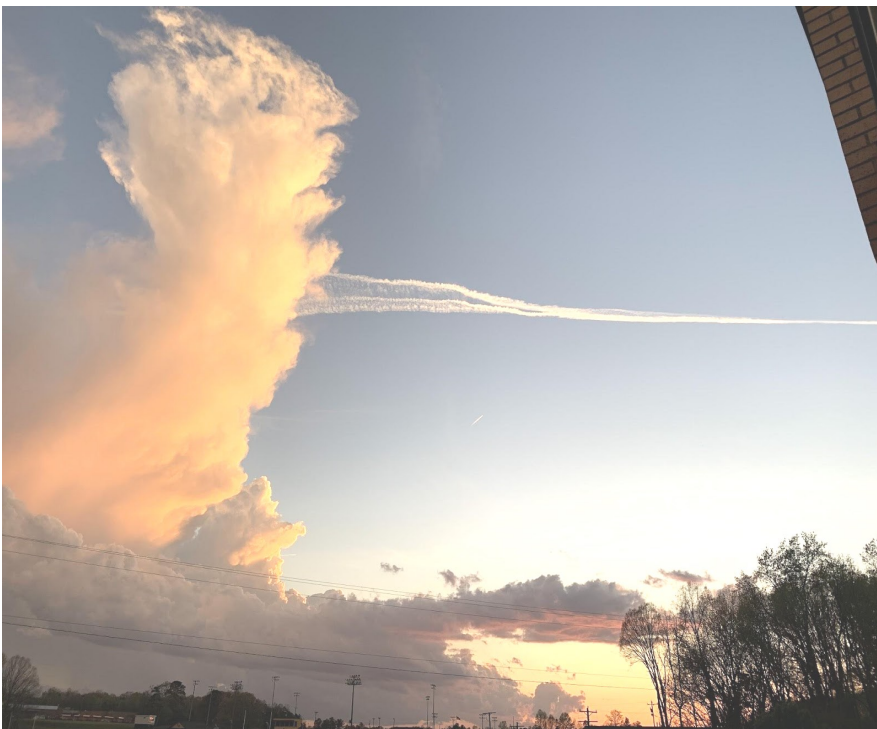
(taken 03/27/2023)