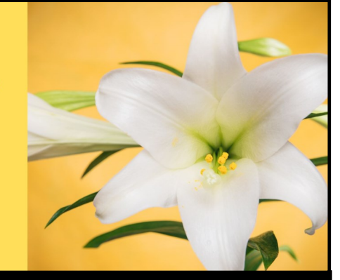
Don't forget to order your Easter Lilies! $12 each Order by 3/22/23

Join us for Worship on Sundays at 10:00am in person or online! Sunday School 8:30am