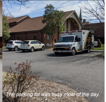
The parking lot was busy most of the day.