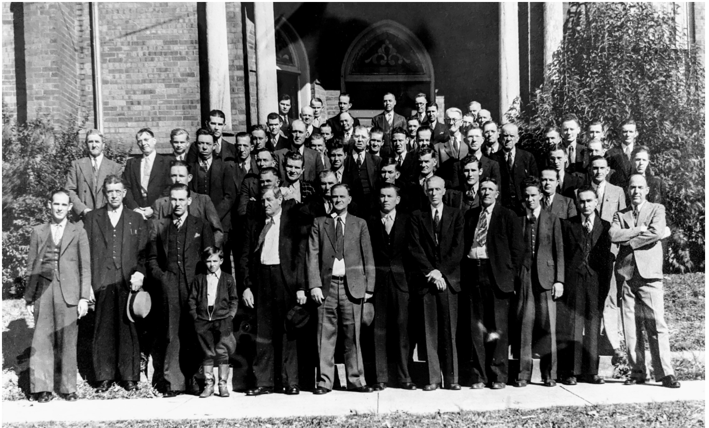
Pictured: 1935 Davis Bible Class outside of the 1905 Central Church building.