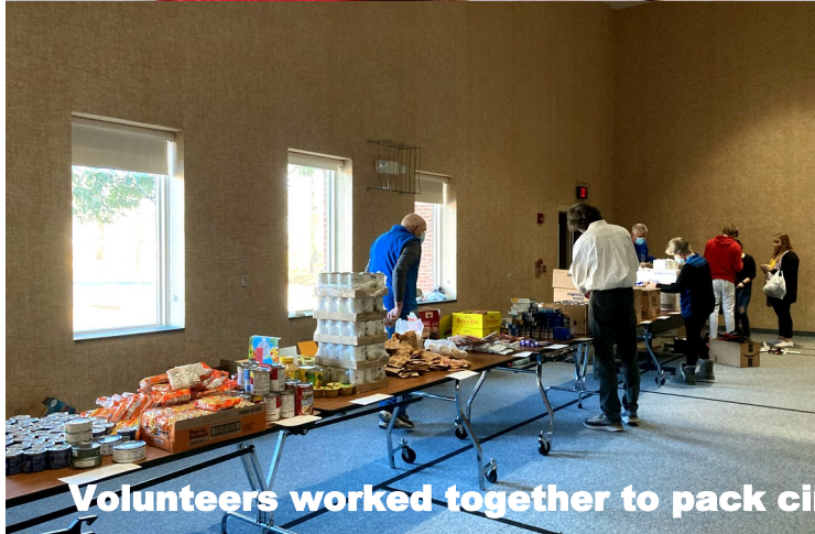
Volunteers worked together to pack cinch sacks on a Sunday after worship.

This prayer was included in each cinch sack.