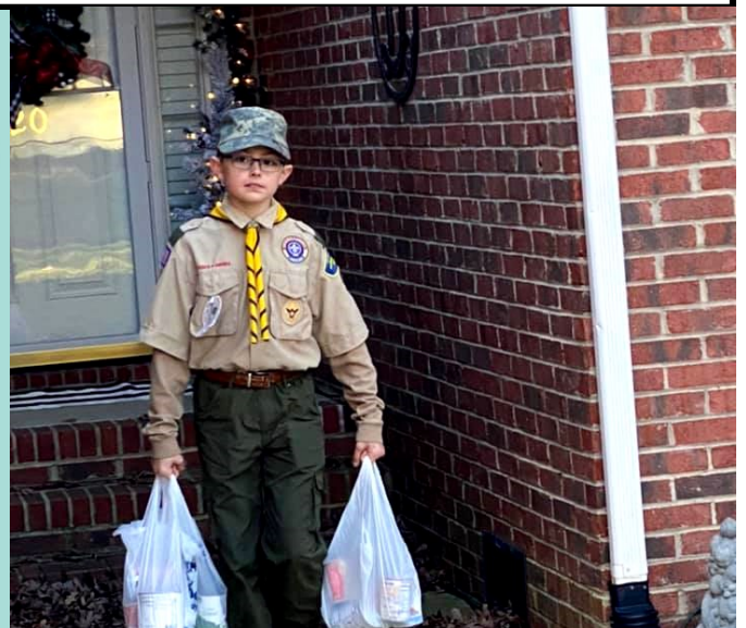
In November, Scouts from Troop 92 completed their Scouting For Food project by collecting food from homes around Kings Mountain. Food will be given to foster families.

For more information, please contact the church office at 704-739-2471.